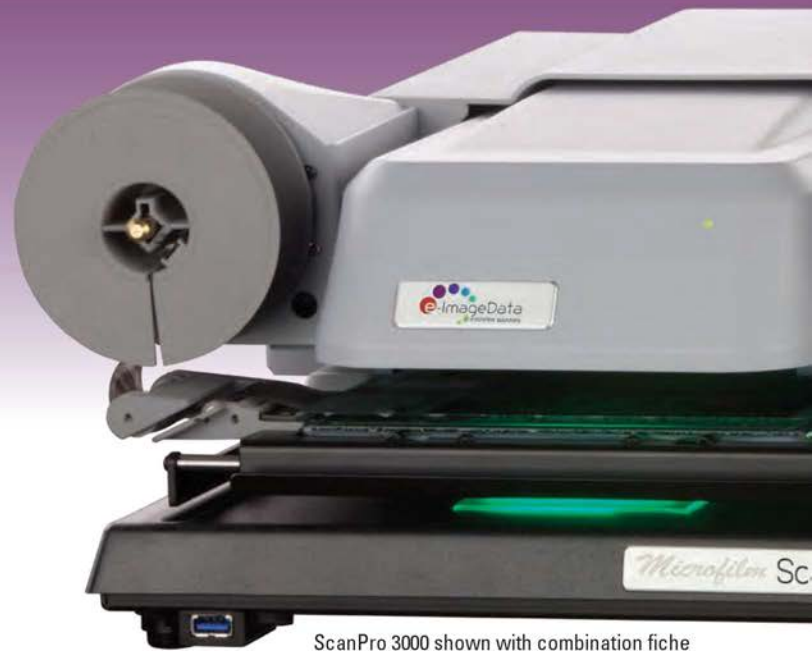
ScanPro 3000 shown with combination fiche and motorized 16/35 mm film carrier

The ScanPro 3000 is designed and built to stand up to the rigors of public use . Our PRECISION-Guide rollers not only control the side-to-side movement of your microfilm, but are designed to protect your microfilm while in use on the carrier glass, safeguarding your microfilm investments. All ScanPro products have a proven track record of performance and reliability backed by factory-trained and certified dealers. In addition, we pride ourselves on our customer service — updating and training our customers as new features and software updates become available.