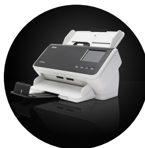
Alaris S2060w/S2080w Scanners