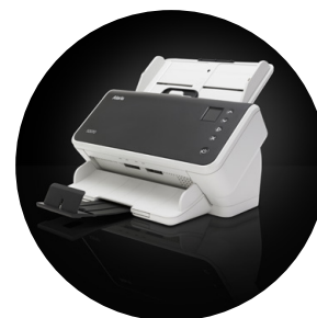
Alaris S2050/S2070 Scanners